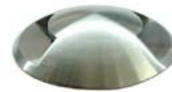
Battlestar Uplight battlestar range