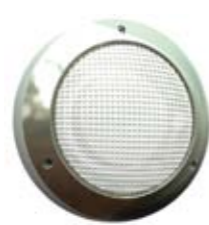
Toronto Plus energy saving lighting