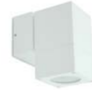
Down Fixed Pillar Box outdoor lights