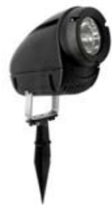
Dedo outdoor lights