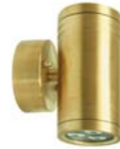
Battlestar Pillar battlestar range