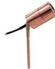
Spike Spot 240V outdoor lights