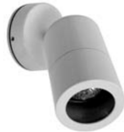
240V Adjustable Spotlight outdoor lights