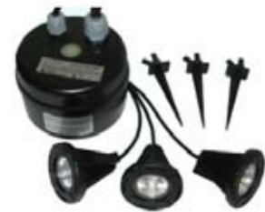
Dragonfly Garden Kit outdoor lights