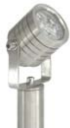
Battlestar Spike battlestar range