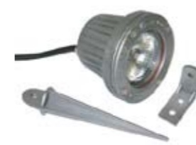
Fountain outdoor lights