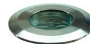
Battlestar Uplight battlestar range