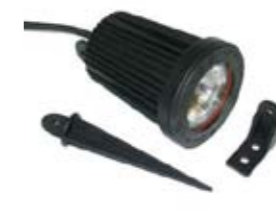
Integral outdoor lights