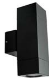
Halogen Fixed Square Pillar Box outdoor lights