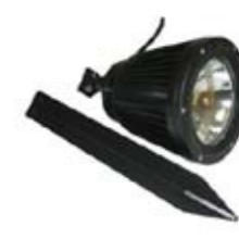
Toad outdoor lights