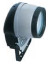
Cyclops outdoor lights