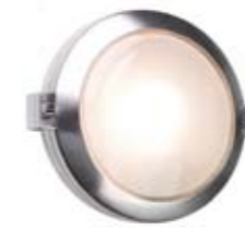
Toronto Round outdoor lights