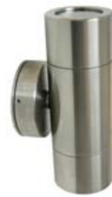
240V Pillar Light outdoor lights