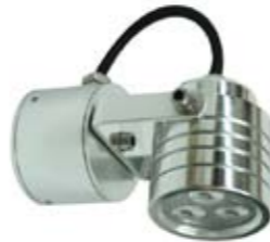
Battlestar Wall battlestar range