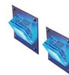
Crystal Step Light crystal range