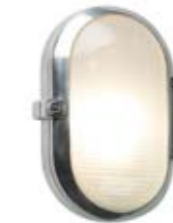
Toronto Oval outdoor lights