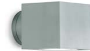
Dual Large IP65 outdoor lights