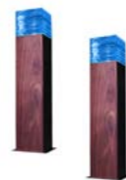
Crystal Bollard crystal range