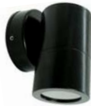
240V Downlight outdoor lights