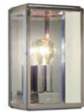
Homefield outdoor lights